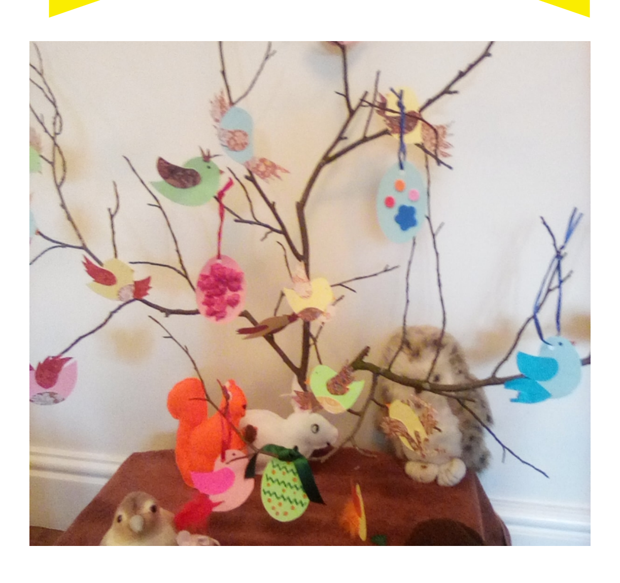
Hang your beautiful eggs and birds on your twig and place in a container for everyone to admire

Card Something to use as hangers (string/ thread or even paper clips) Bits and bobs for decoration A twig (or a plant in your house) A container to display it