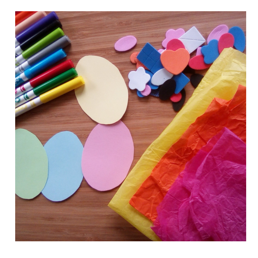
Cut out your egg and bird shapes. You can use printouts of the template but even card from cerial packets will work

Remember to share your pics on The Cooper Gallery digital channels. We'd love to see them.