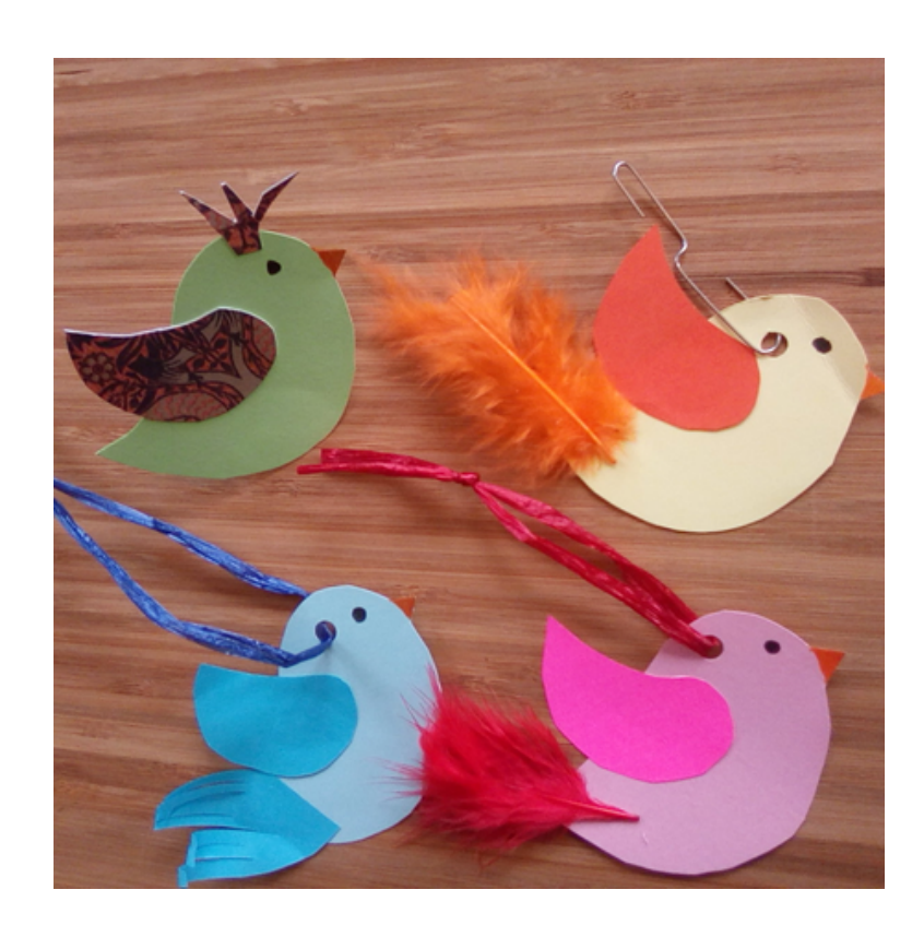
Add your beautiful birds wings last- these can be feathers or card or paper or even a leaf