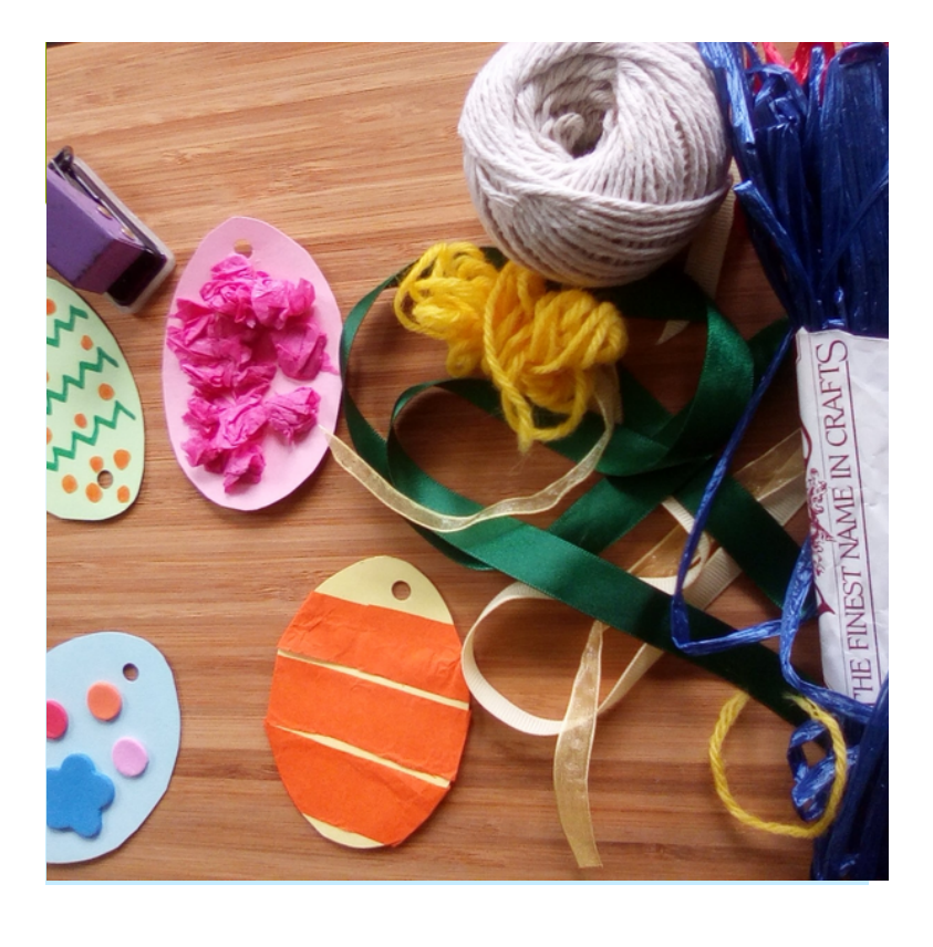
Use whatever decorative bits and bobs you have at home to decorate your shapes