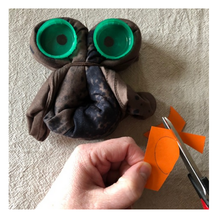
Cut out a beak shape from paper and attach using sticky tape.

Fold the fabric in half length ways. Then fold the ends down on either side. Secure with elastic band, hair-bobble or string.