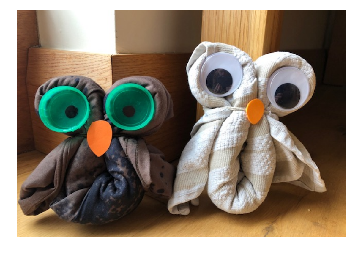
Your owl is finished. T-wit T-whoo! Why not make a friend for your owl?