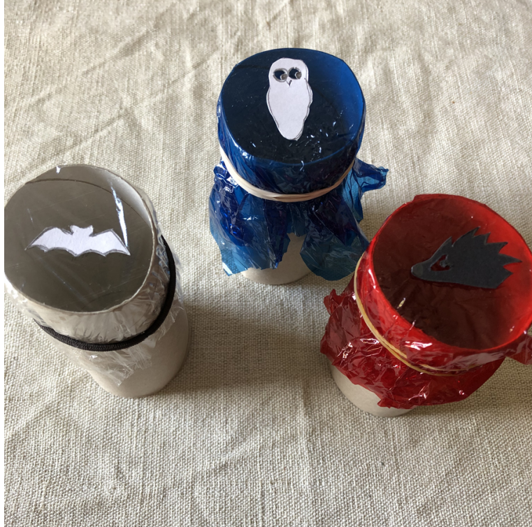
Cut out your shape and stick in the centre of the plastic using glue.

On a piece of paper or card draw round the end of the tube. Inside the circle draw the shape of an object, animal, plant or anything you like, making sure you don't touch the edges of the circle and leaving a good gap. Smaller children might find it easier if you draw a smaller circle inside the first circle to draw within.