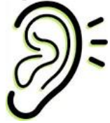
A voiceover in the corridor