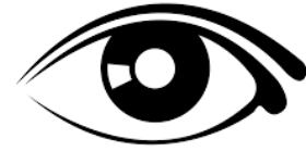
Paintings and Ceramics