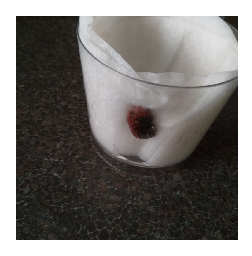
Now carefully place your bean between the kitchen towel and the outside surface.