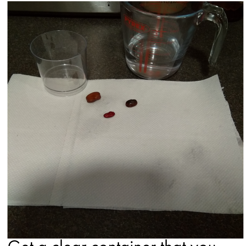
Get a clear container that you can see through and some kitchen towel (about 3 sheets that you leave attached to each other).

Now, we haven't got any magic beans but watching a seed as it grows is pretty magical so, if you want to watch some beans grow you could plant them in some soil but if you'd like to see the root and the shoot as it starts growing you could try this.