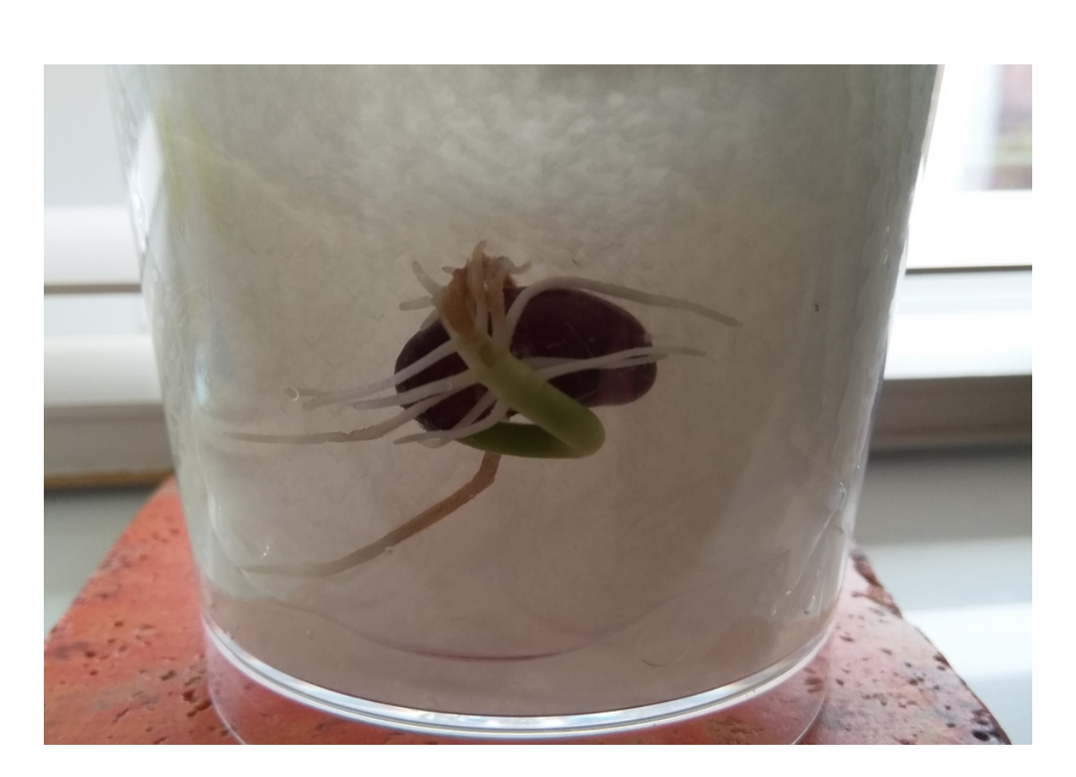
Make sure you keep the kitchen towel damp. Watch your seed grow.