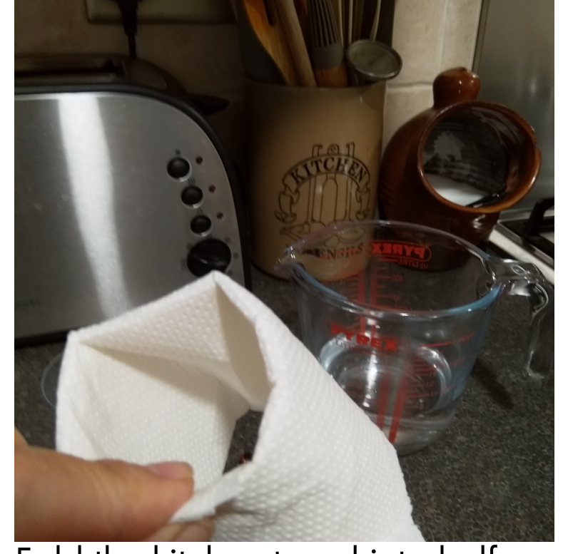
Fold the kitchen towel into half and then into quarters. Curl it gently inside your container.