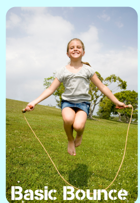
Both feet together on the spot