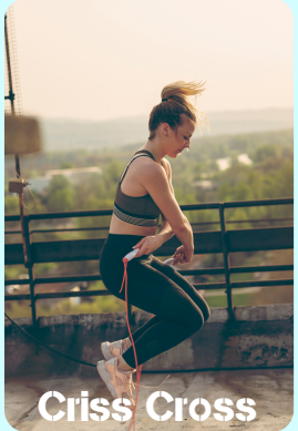
Cross your arms over in front of you every other skip