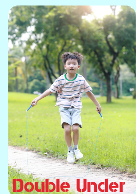
Two turns of the rope in one jump

You just need a skipping rope and a pair of scissors for this activity