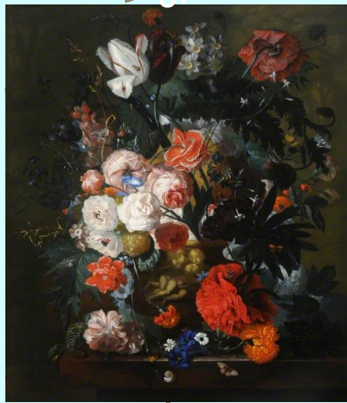
Flower Piece by Jan Van Huysum- Barnsley Museums

Have you watched and sung along to our Market Day story yet? Did you spot this beautiful painting by Van Huysum in the film?