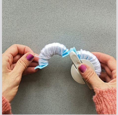
3. Close that wrapped half of the maker and open the other side. Repeat wrapping the wool around this half.