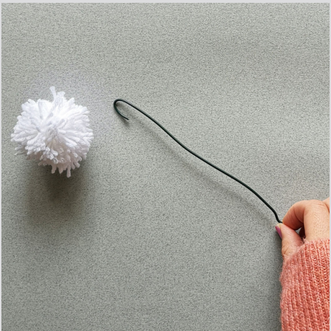
9. Take your wire and make a hook at the end. Hook it through your pom pom so that it catches in the wool and stays in place.