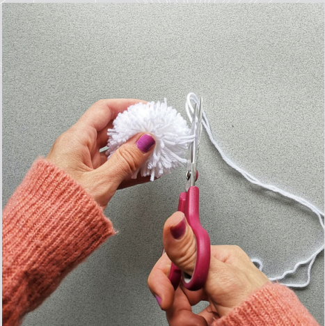
8. Trim the long piece of wool and give your pom pom a trim.