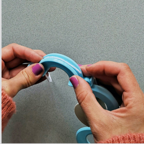
1. Open one side of the pom pom maker and place the end of the wool along the centre, hold in place with one hand.