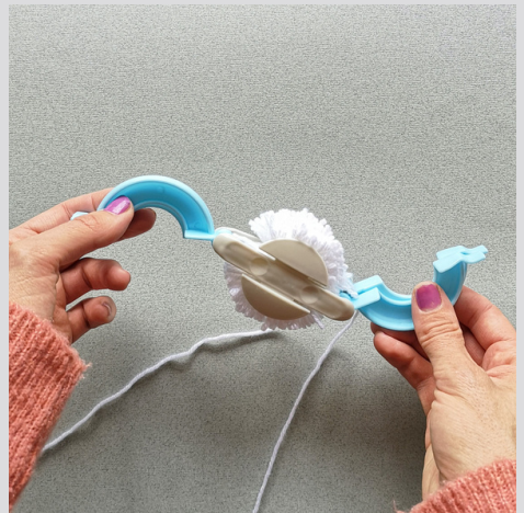
6. Open up the maker fully,