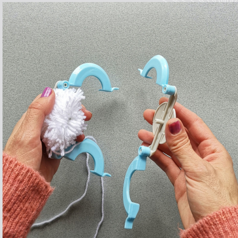
7. Holding the pom pom in place, with one hand, use the other to pull off one side of the pom pom maker.