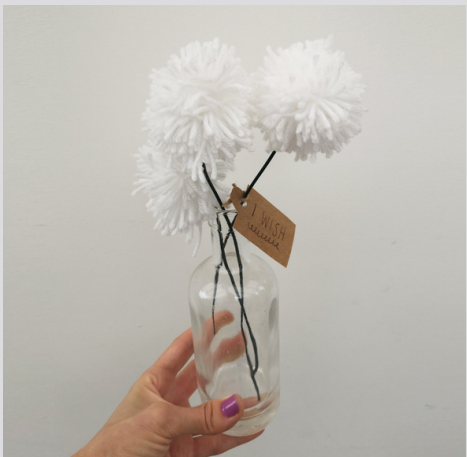
Keep inside in a vase.