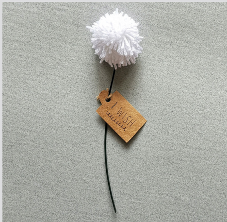
Write a wish on a label or a piece of card, with a hole punched through and attach to your stem with string.