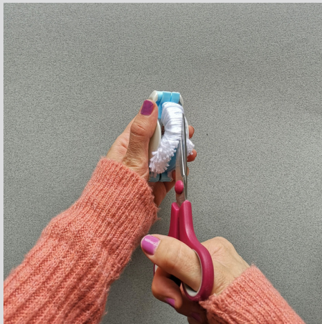
4. Close the pom pom maker fully, hold tight in one hand and cut along the middle of the semi circle carefully using sharp scissors. Ask an adult to do this.