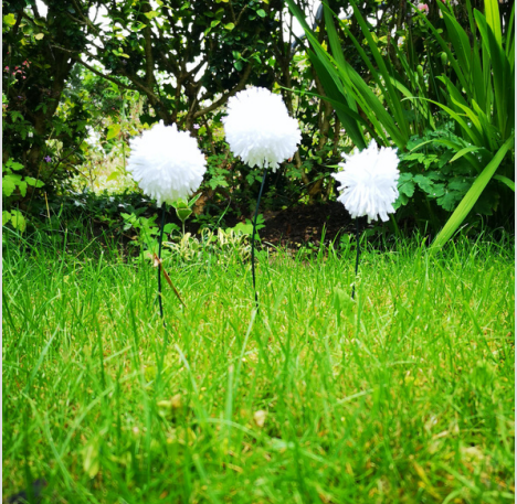
Or display outside amongst the flowers.