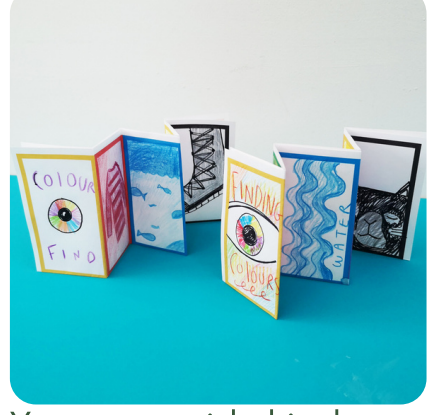
You can squish this down and use as a mini book or open out to display.