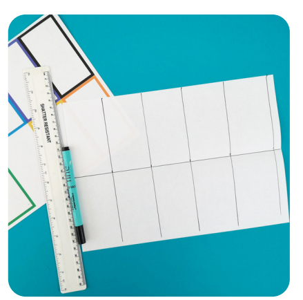
Use the template or divide a piece of paper so you have 10 rectangles. Each box is around 5.5cm x10.5cm.