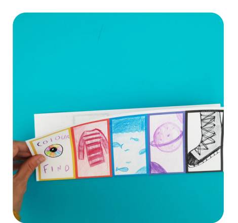
Top tip for later: Flip your paper after the top row and draw the bottom row so they are upside down.