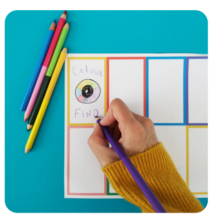
In the top right corner, design your front cover and give your trail a title.