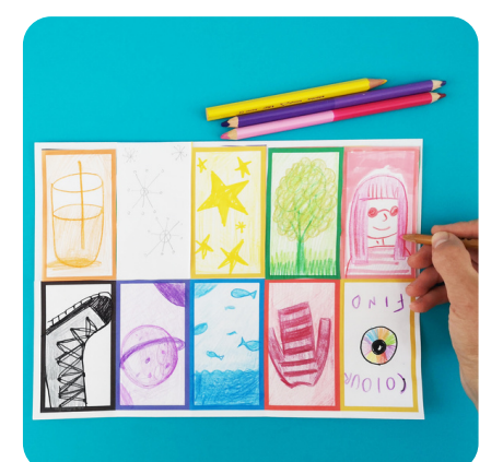
Find things in the Elmer colours (yellow, red, blue, purple, black, pink, white, green). Draw them in each box.