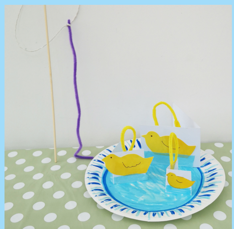
Attach a piece of string to the end of a stick and tie a pipe cleaner to the end of the string. Make a hook shape and see how many ducks you can hook.