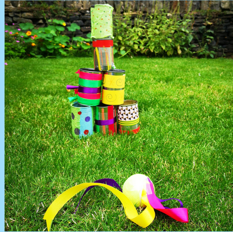
Using your collage materials, decorate the cans. You can decorate the tennis ball too with scraps of fabric or ribbon. Stack the tin cans and see how many you can knock over when you throw the ball

Have a go at recreating these retro funfair games at home using things around the home and a few crafty materials. You might be inspired to make up your own games too.