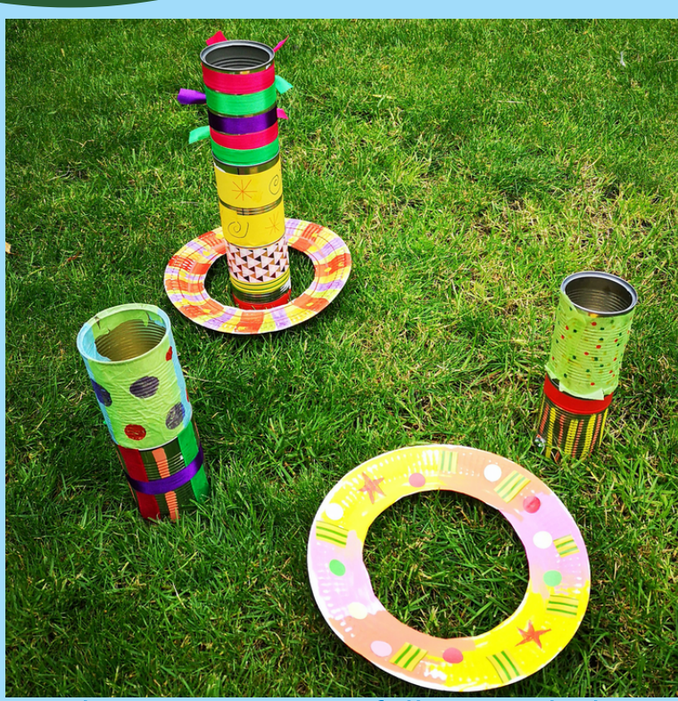
For the ring toss, carefully cut a hole out of the middle of a paper plate, decorate and see how many plates you can get over the upright tins. You can also use sticks in the ground or branches of a tree.