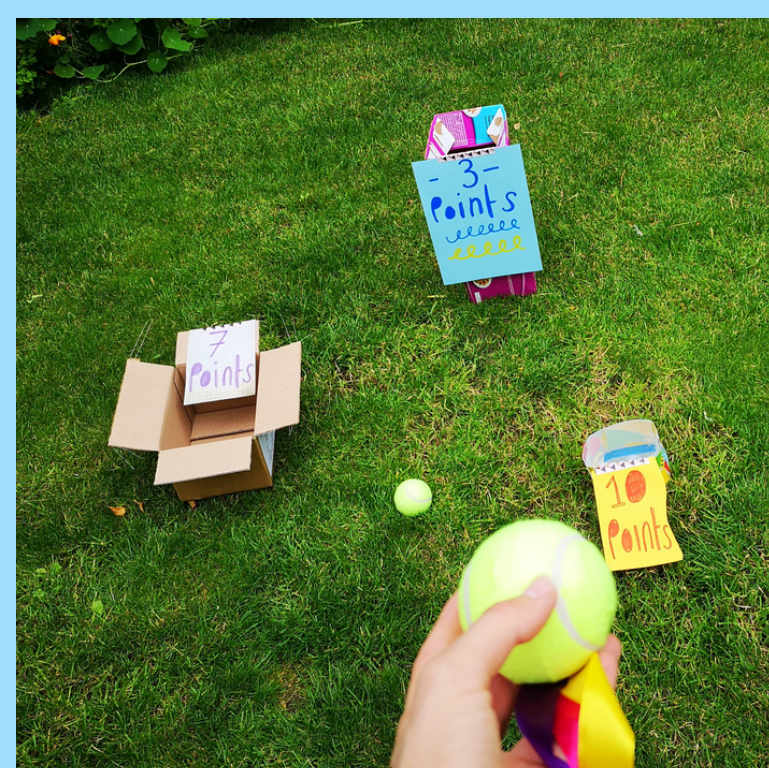
If you have any empty boxes around the house collect them up and add points to the front. Higher points for the smaller boxes or ones further away. Using your tennis ball, see if you can get the ball into the boxes!