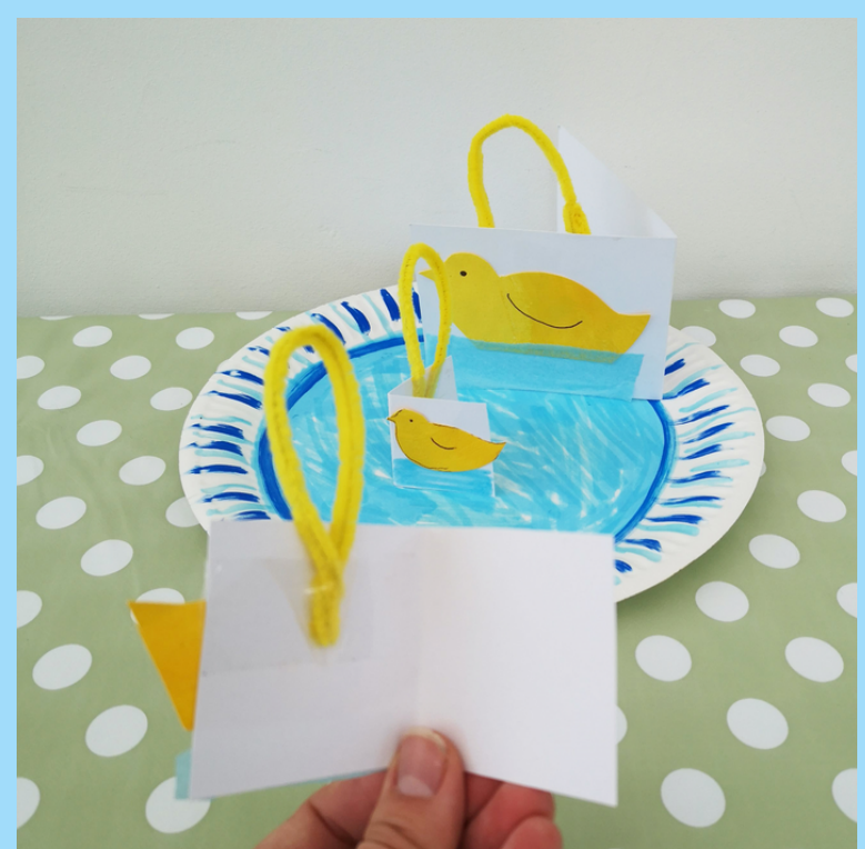
Draw or cut out a duck shape and stick to the front of the folded card. Try doing different sizes. Cut a pipe cleaner in half, loop and stick to the inside of the card.