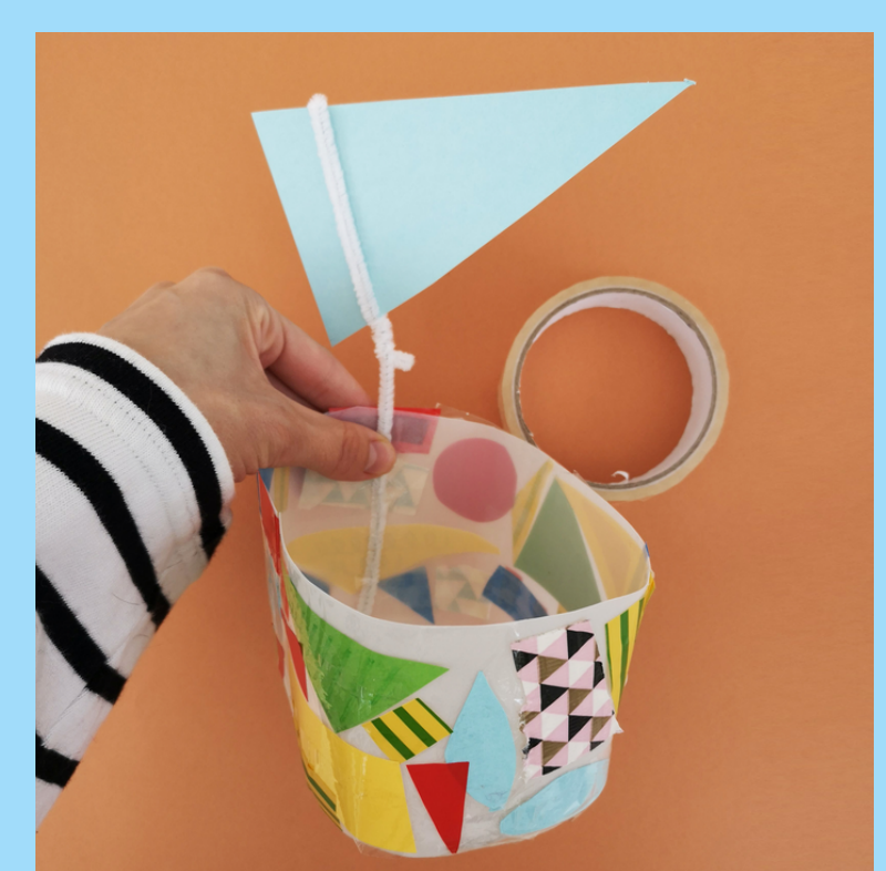
Tape the bottom of the pipe cleaner to the inside of your boat.

Now using the jug of water, test out how much water your boat can hold before it starts the sink! You can also test out other weights in the boat to see how much it can hold....perhaps a bar of soap or a tube of toothpase!