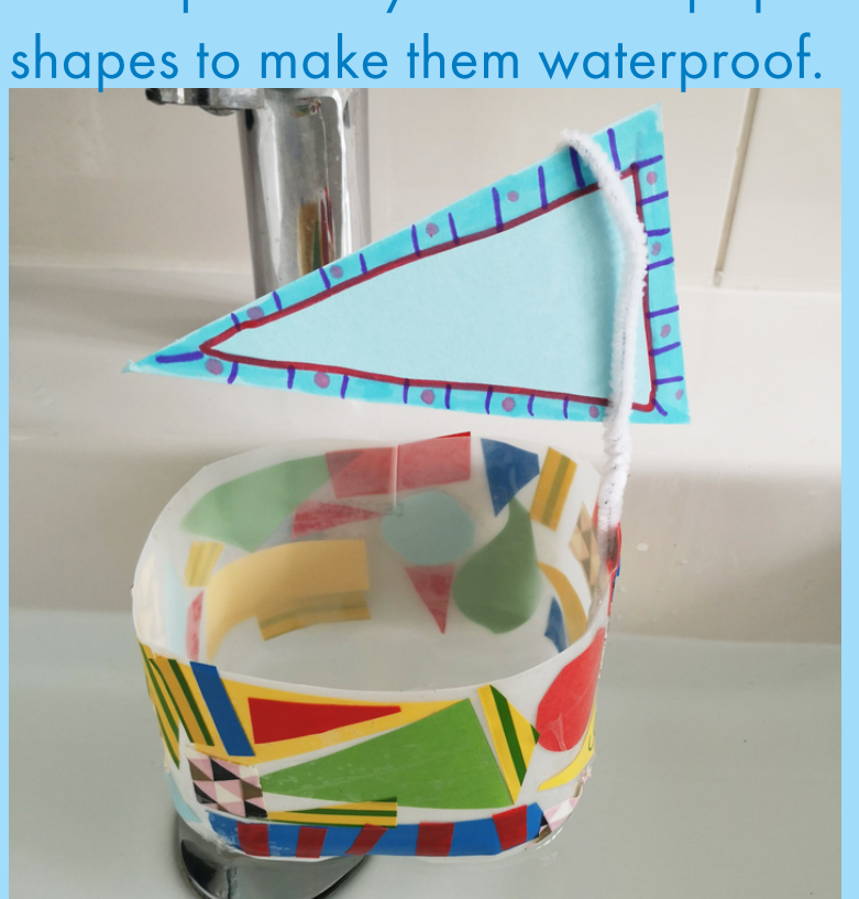
Fill some water in the sink (or bath) and see if your boat floats.