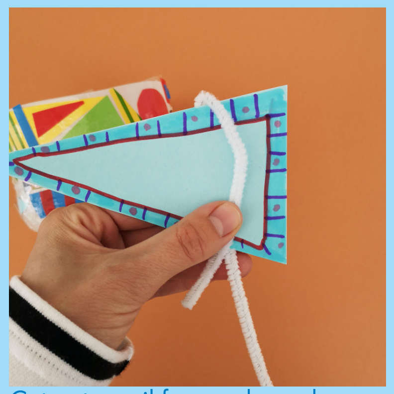
Cut out a sail from coloured paper. You can decorate it too. Then using your pipe cleaner, attach it to the sail. You can wrap and knot it round or use tape