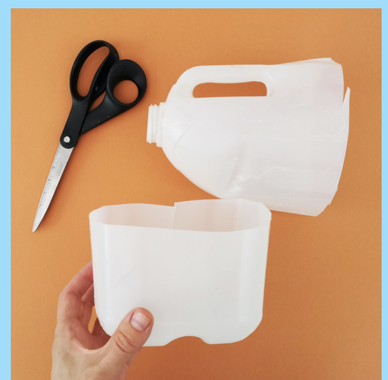
Ask an adult to help you to cut the milk bottle in half.