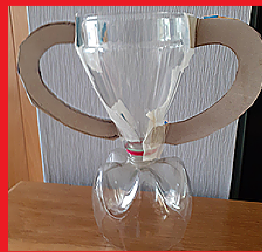
Attach handles at either side of the trophy with tape.