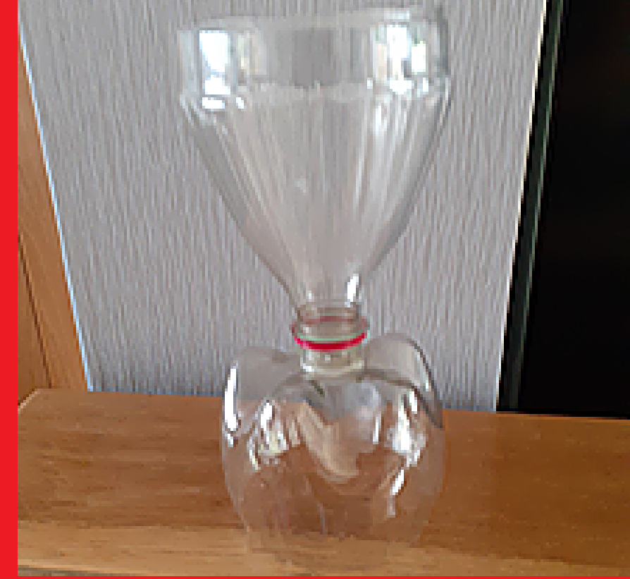
Cut the top third from the bottle and keep to one side, remove the middle third and throw away. Turn the bottom third upside down and the place the upside down top third on it and fix with PVA.