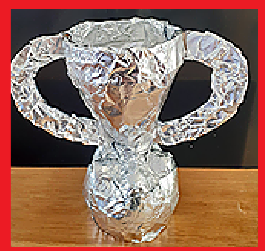
Finally cover with strips of foil securing with PVA. You can make a name for your trophy by covering a cardboard shape with foil, writing it onto the foil and sticking onto the front.