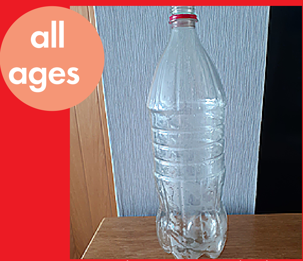
Start with an empty pop bottle. Cutting pop bottles can be tricky so have a grown up at hand to help with the cutting bits.