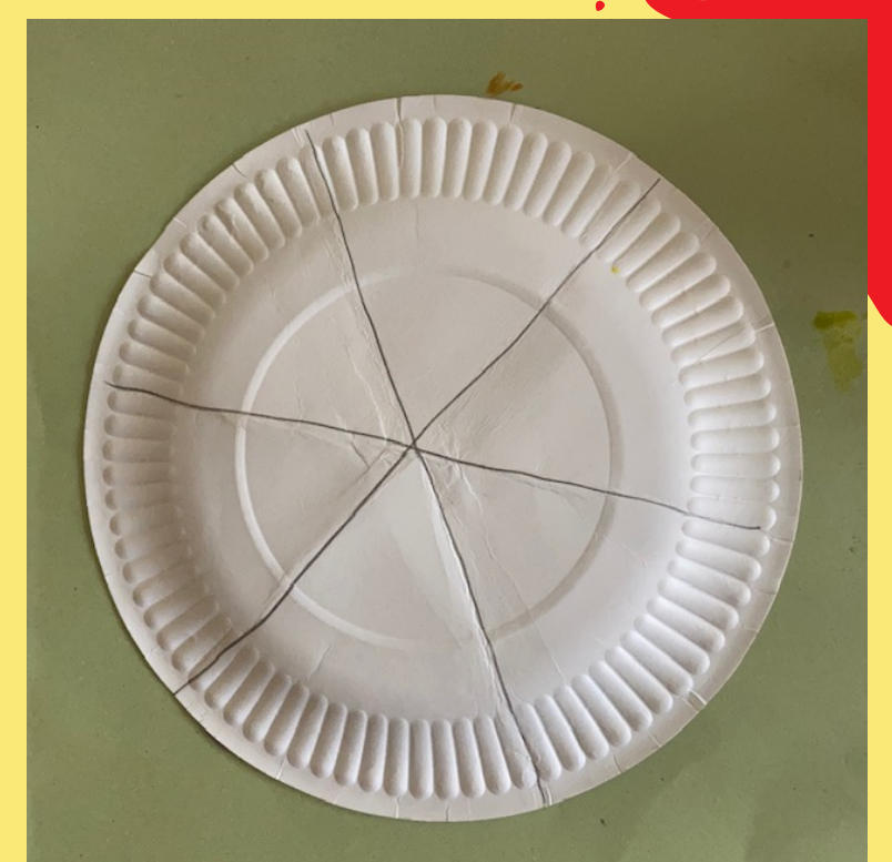
Unfold your plate and mark in pencil along the creases