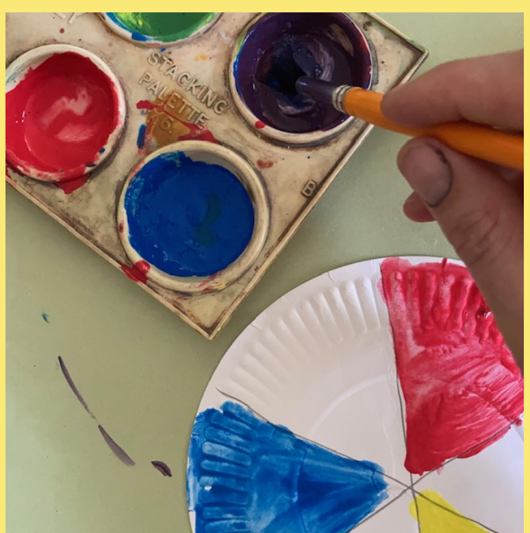
Now look at your plate. You are going to make your secondary colours. Look at your empty segments and mix the two colours together from each side of them. This shows you which secondary colours that the primary colours make. Be careful to wash out your brush inbetween or you will end up with a mucky bown!