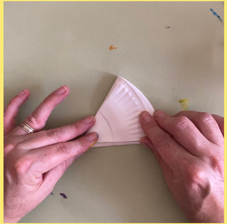
Carefully fold your half into thirds. You might need a grown up to help you do this