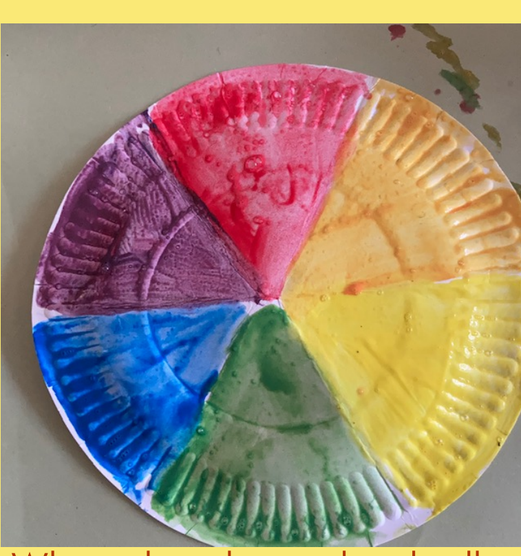
What colour does red and yellow make?