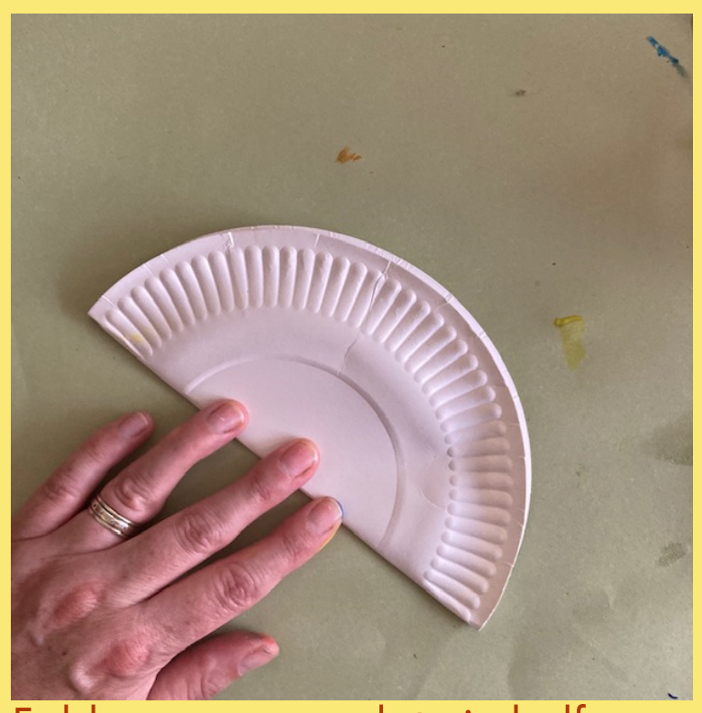
Fold your paper plate in half