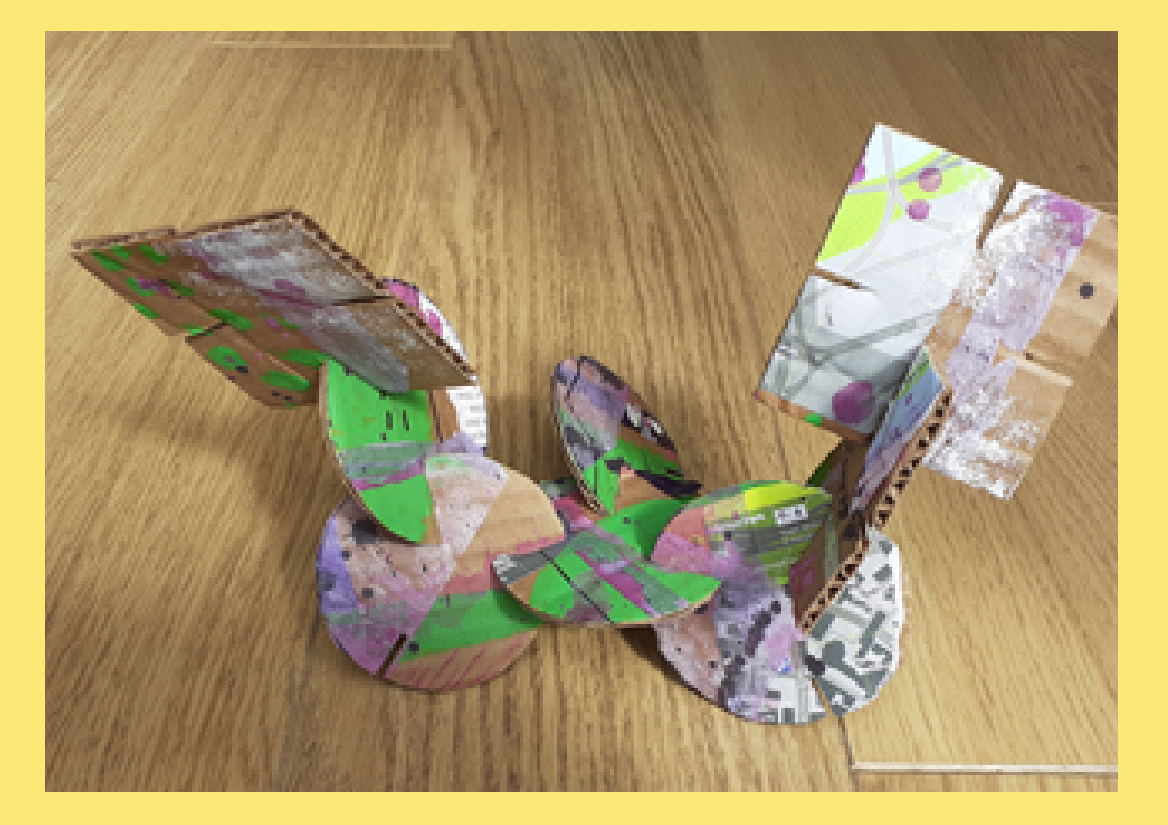
Join the shapes together in any way you choose and you will have your very own unique 3D art work.

Cut some slots in your shapes. You can then start assembling your sculpture.