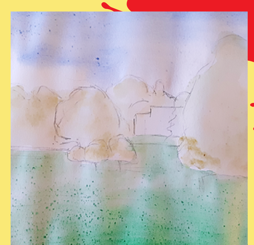
Add light blocks of colour to each of the thirds separately. Colour and detail will build up through the process