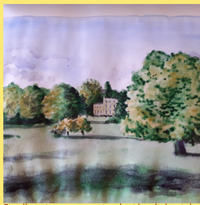
Finally using a grey mixed with a little violet you can strengthen the shadows. Using a pencil draw the details on Cannon Hall and paint using a pale yellow for the walls and grey for windows.