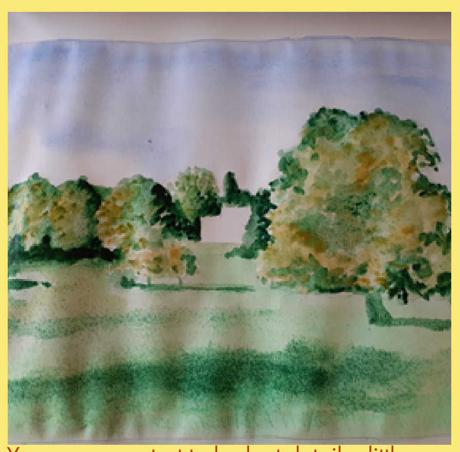
You can now start to look at detail a little more and add shadows remembering to leave to light areas, you don't need to use white paint for this