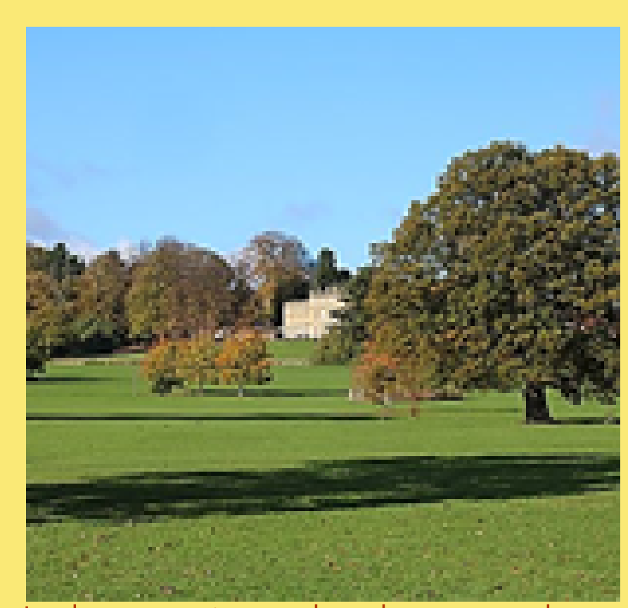
Look at your view and work out a good composition. This photograph is a good example, it is divided into 3 areas of distance. The top third is sky. The middle third has more detail the trees and house. The bottom third is the area closest to you (the grass and shadow)