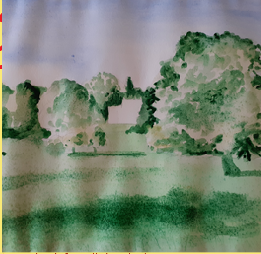
Now look for all the darkest areas, you can try squinting to make them more obvious. Don't try to paint each branch and leaf look for dark and light areas.