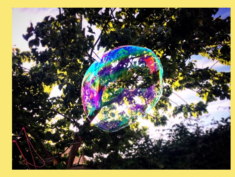
Now experiment with lots of different colours.

Once you are happy with your artwork why not ask an adult to spray it with either hairspray or fixative to keep it from smudging?