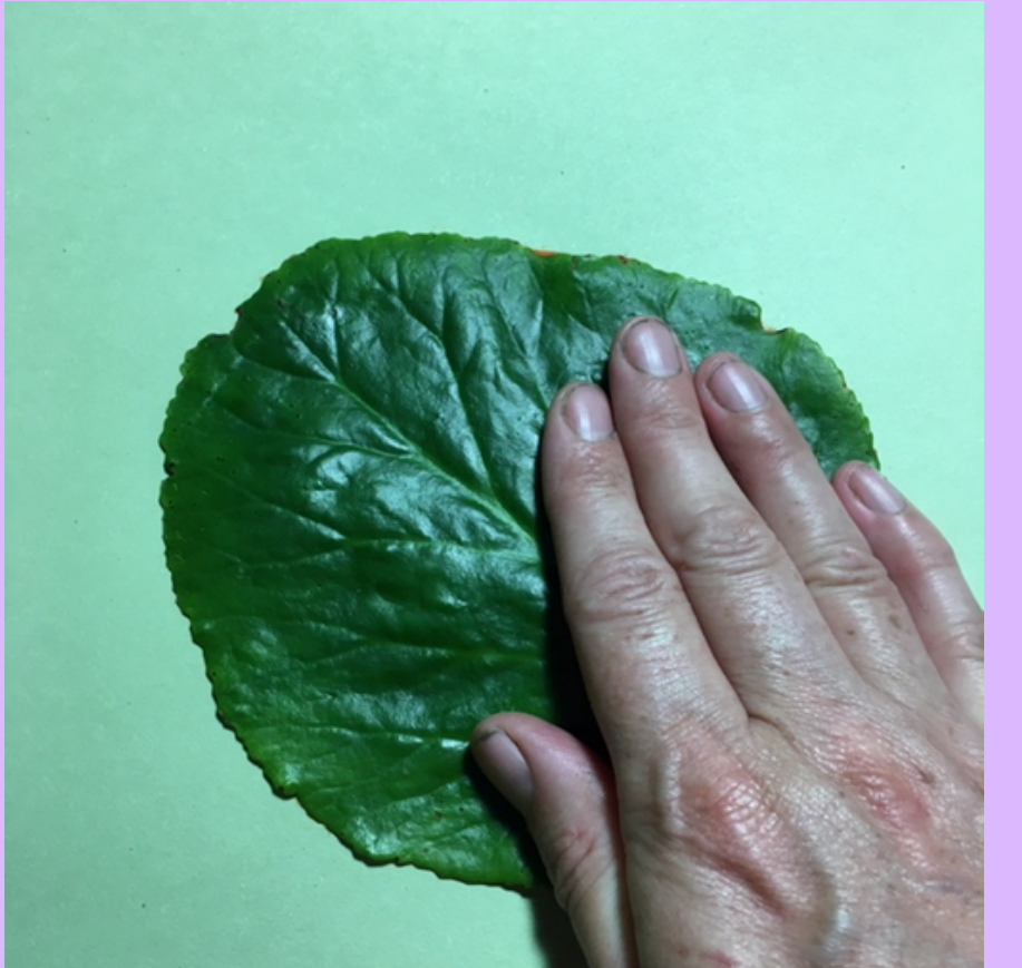
Put the leaf face down on your paper and rub the back to get a good print.