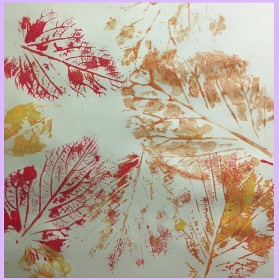
Use different colours of paint and different shaped and sized leaves to make your picture.