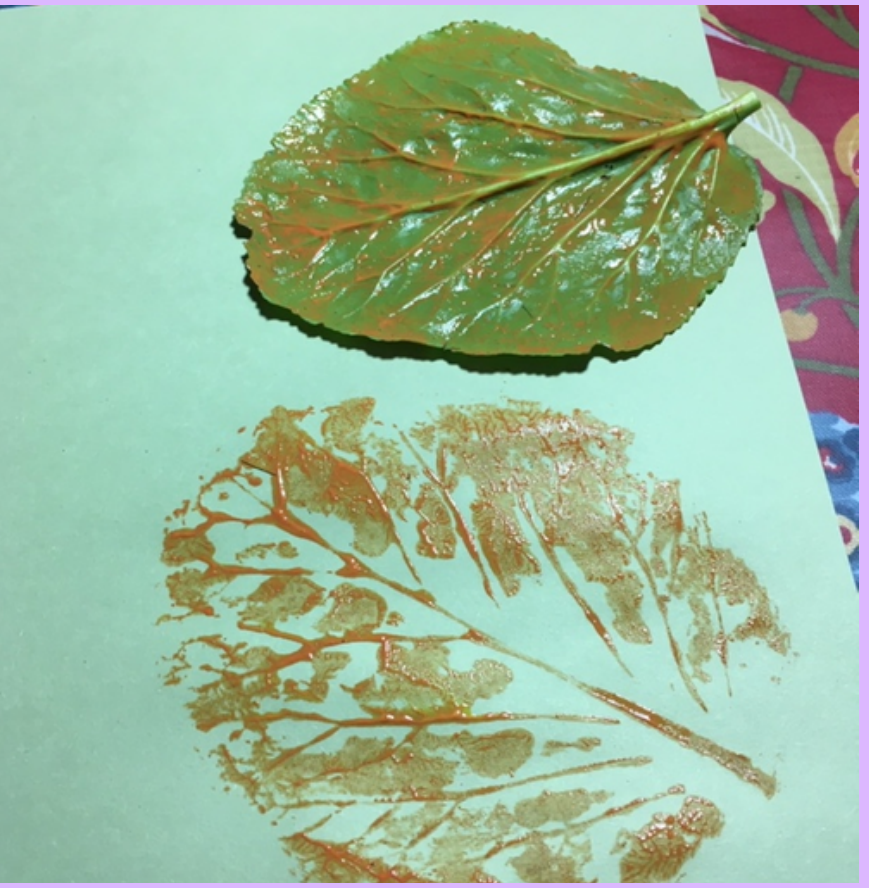
Carefully lift your leaf and reveal your print.