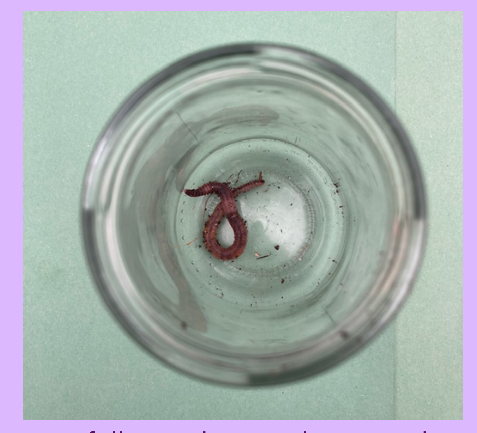
Carefully catch a minibeast and pot it in a clear jar or bug collecting pot. The best places to find creatures are under rocks, pots and fallen wood.

Bug collecting pot or a jam jar/ paper & elastic band Pencil Magnifying glass (optional) Paper