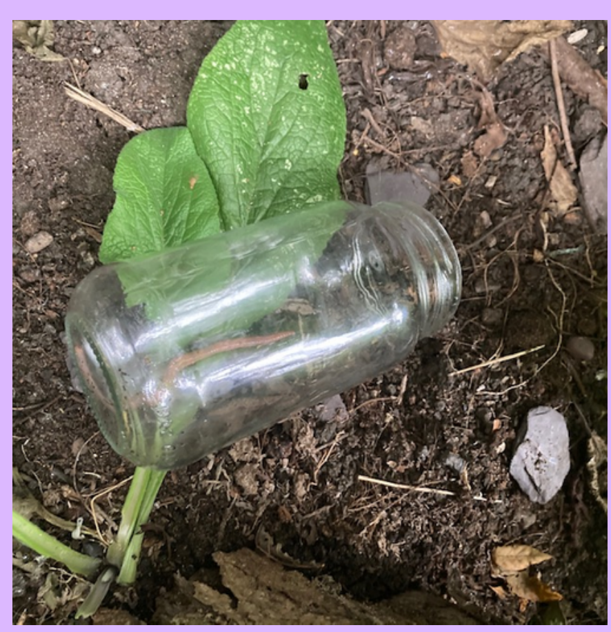
As soon as you have finished drawing it, return it to the same place you found it, being careful not to hurt it as you set it free.