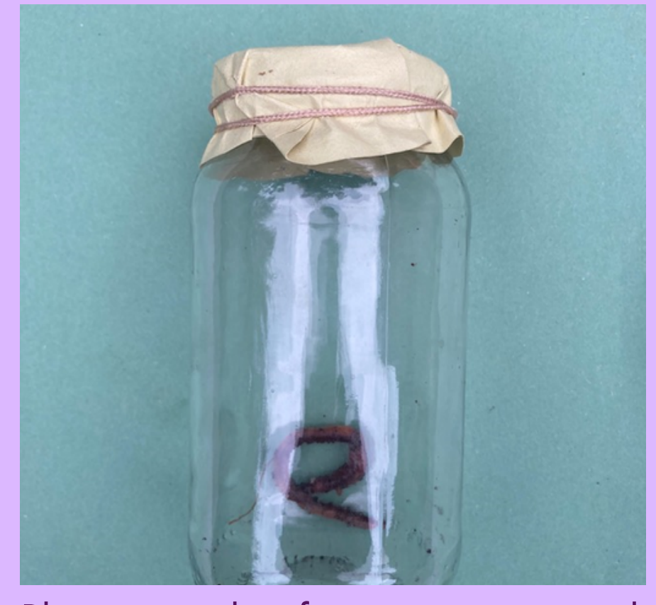
Place a circle of paper on top and secure with an elastic band.