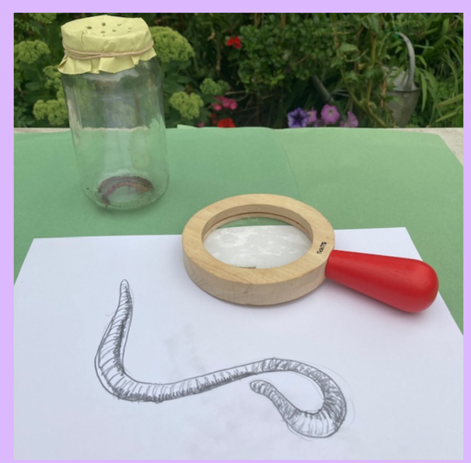
Draw your creature- remember to keep looking at it as you go.