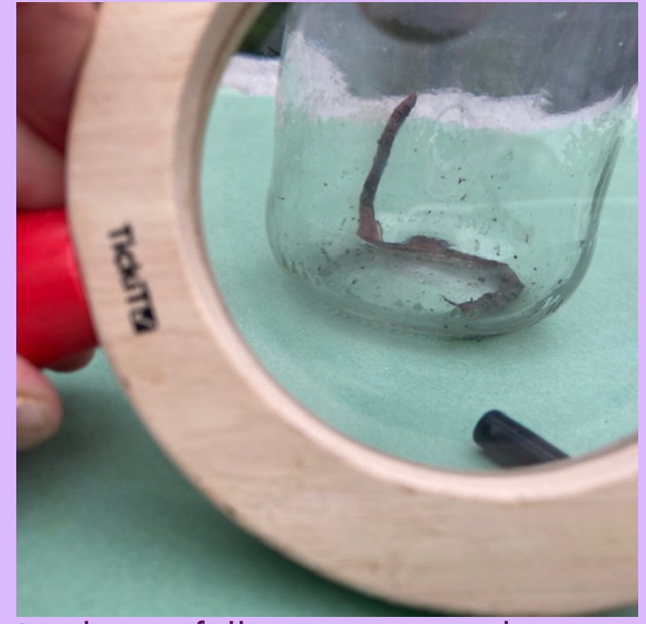
Look carefully at your mini beast, what shape and colour is it? what texture is it? Does it have any special markings or patterns?