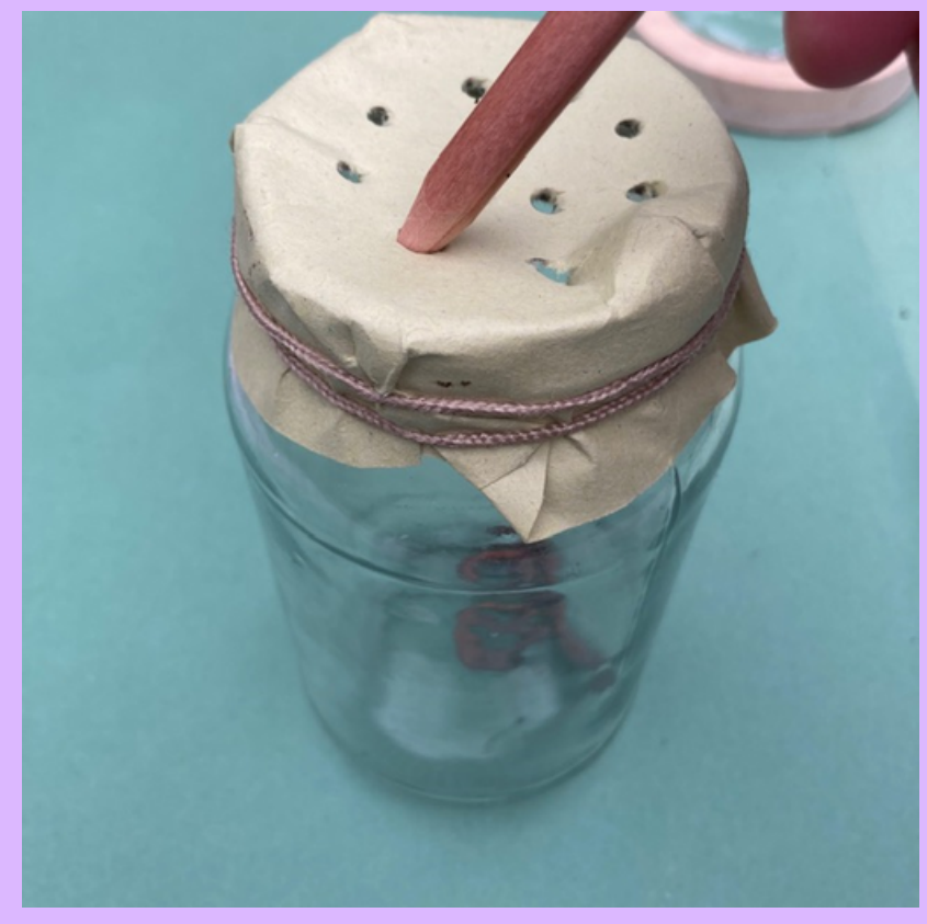
Very carefully, as you don't want to harm your creature, poke some holes in the paper so your mini beast can breathe.