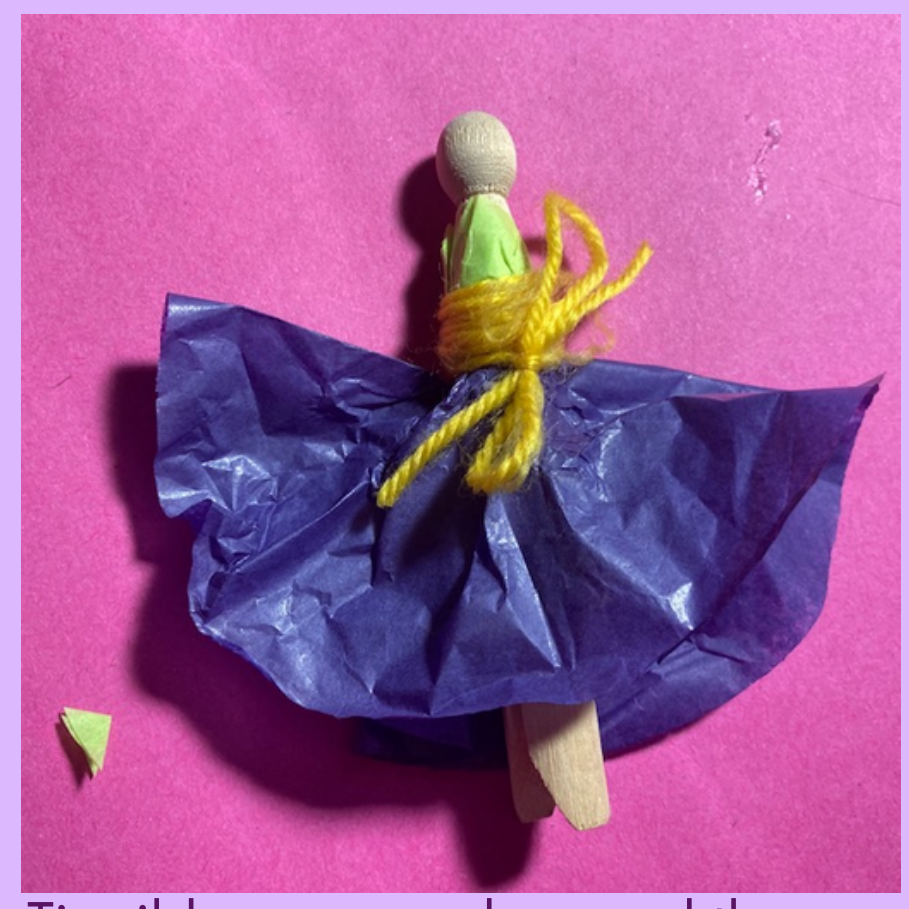
Tie ribbon or wool around the waist to hold it in place