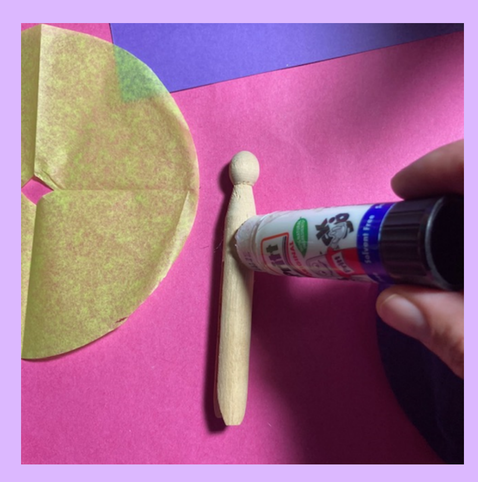
Glue your peg and push the peg through the hole you cut in the tissue paper circle and smooth around the top of the peg to make the top part of your fairy's outfit.