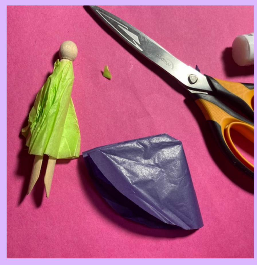
Fold the other tissue paper into quarters, cut the point off and push the peg through to make the skirt.