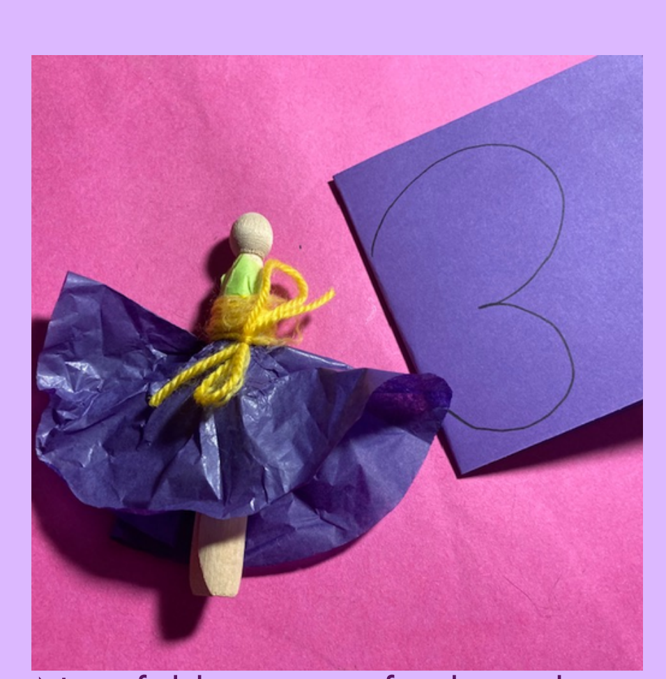
Now fold a piece of coloured card or paper in half, and mark on the wings along the fold and cut out.