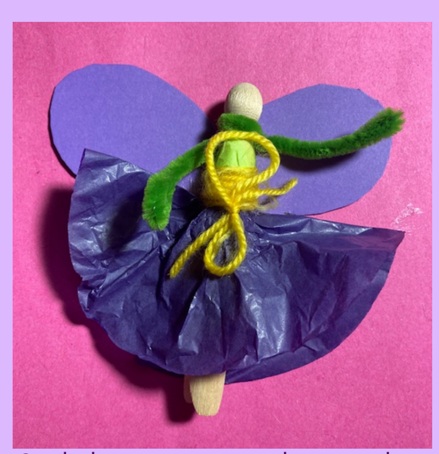
Stick the wings on with your glue stick and add some pipe cleaner arms.