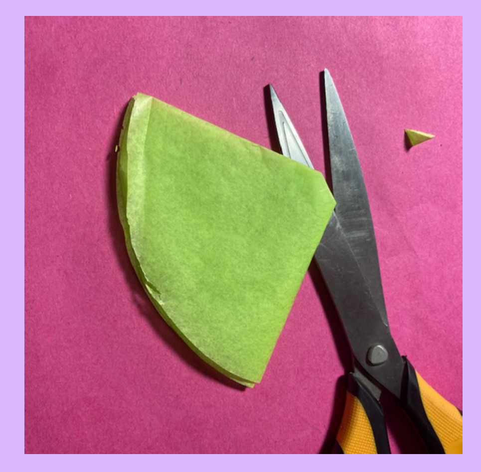
Fold a tissue paper circle into quarters and cut off the point.

Dolly peg Glue stick Scissors 2 x tissue paper circles Wool/ ribbon Coloured paper/ card Pipe cleaner