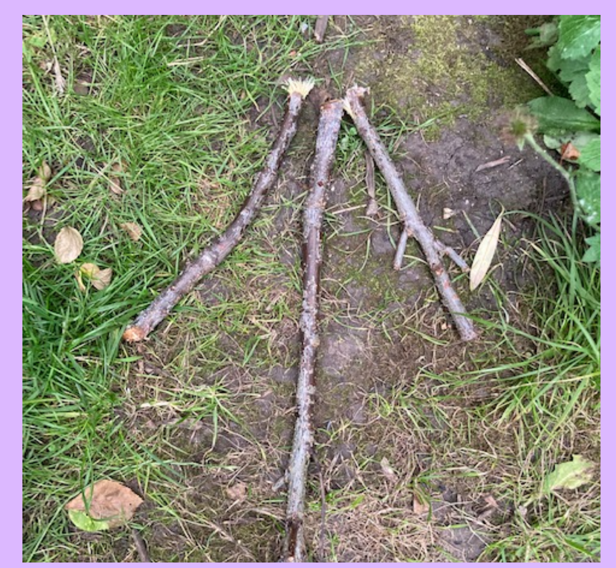
Twigs as arrow: Straight ahead