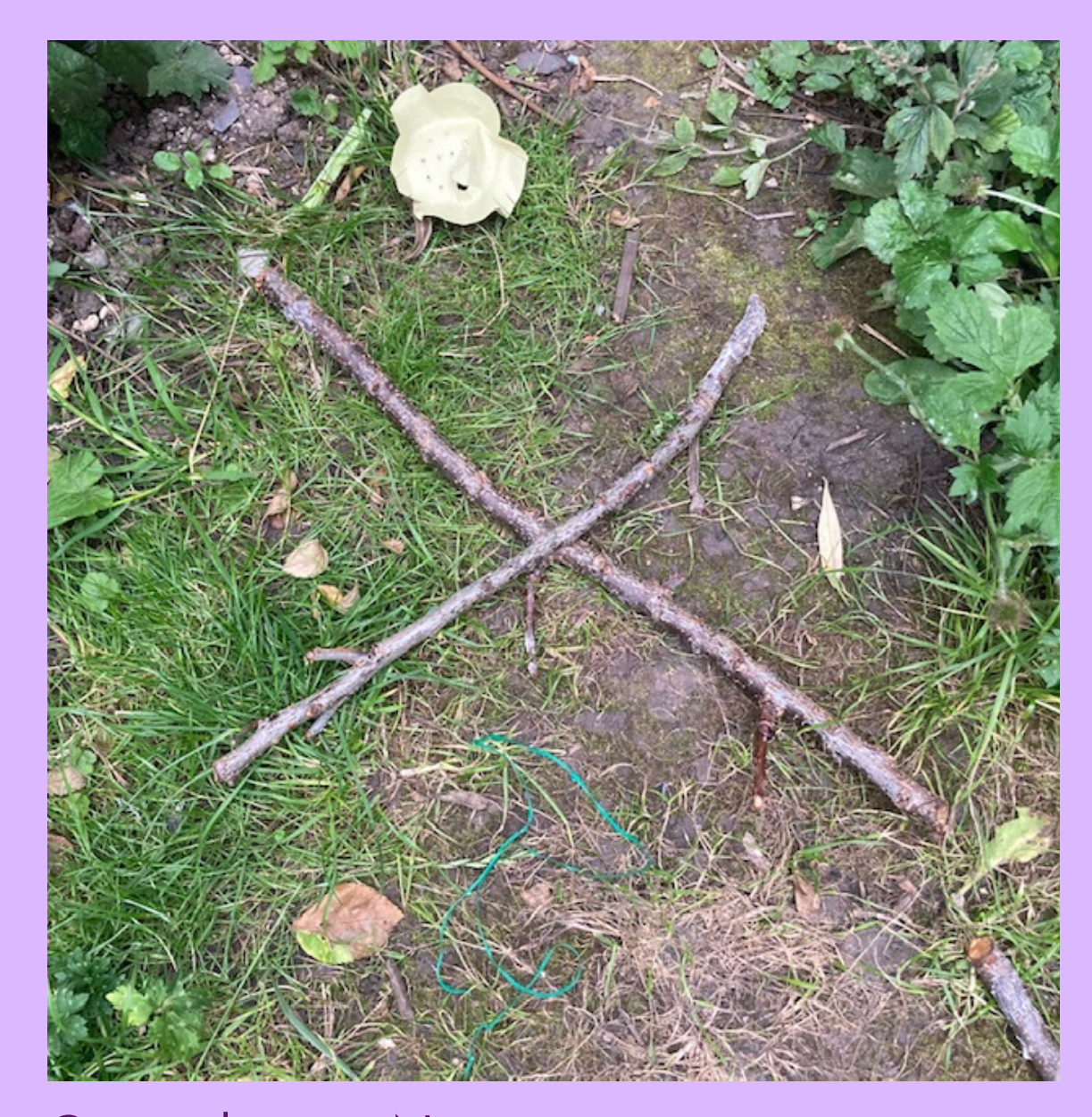
Crossed twigs: No entry