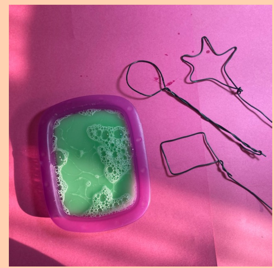
Try making different shaped blowers- does it change the shape of the bubbles?