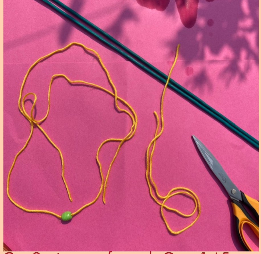
Cut 2 pieces of wool. One 145cm long and one 70cm long. thread the bead onto the longer piece of wool.

Wool Scissors A large bead 2 green garden canes Bubble solution Tape