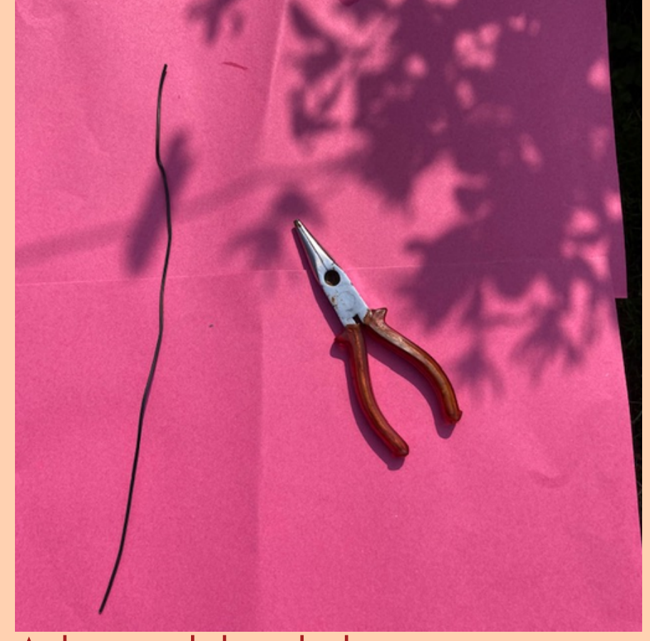
Ask an adult to help you cut a piece of wire.