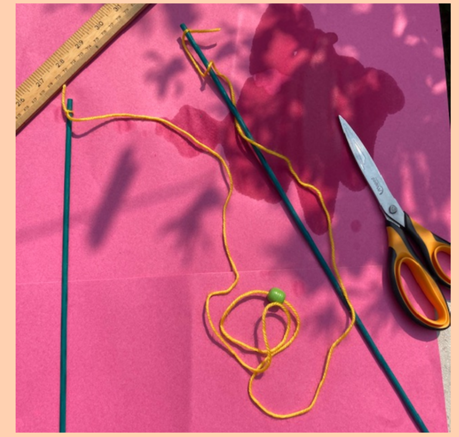
Tie the long piece of wool to the top of each of the sticks. Leave a little bit of excess wool hanging loose.