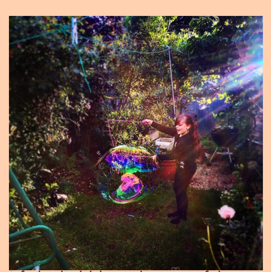
Lift the bubble maker out of the solution by holting the sticks and pull yout arms apart. The bead will weigh the longer piece of wool down and you'll get a triangle with a bubble suppended in the middle. If you waft your arms slowly a bubble will be made.