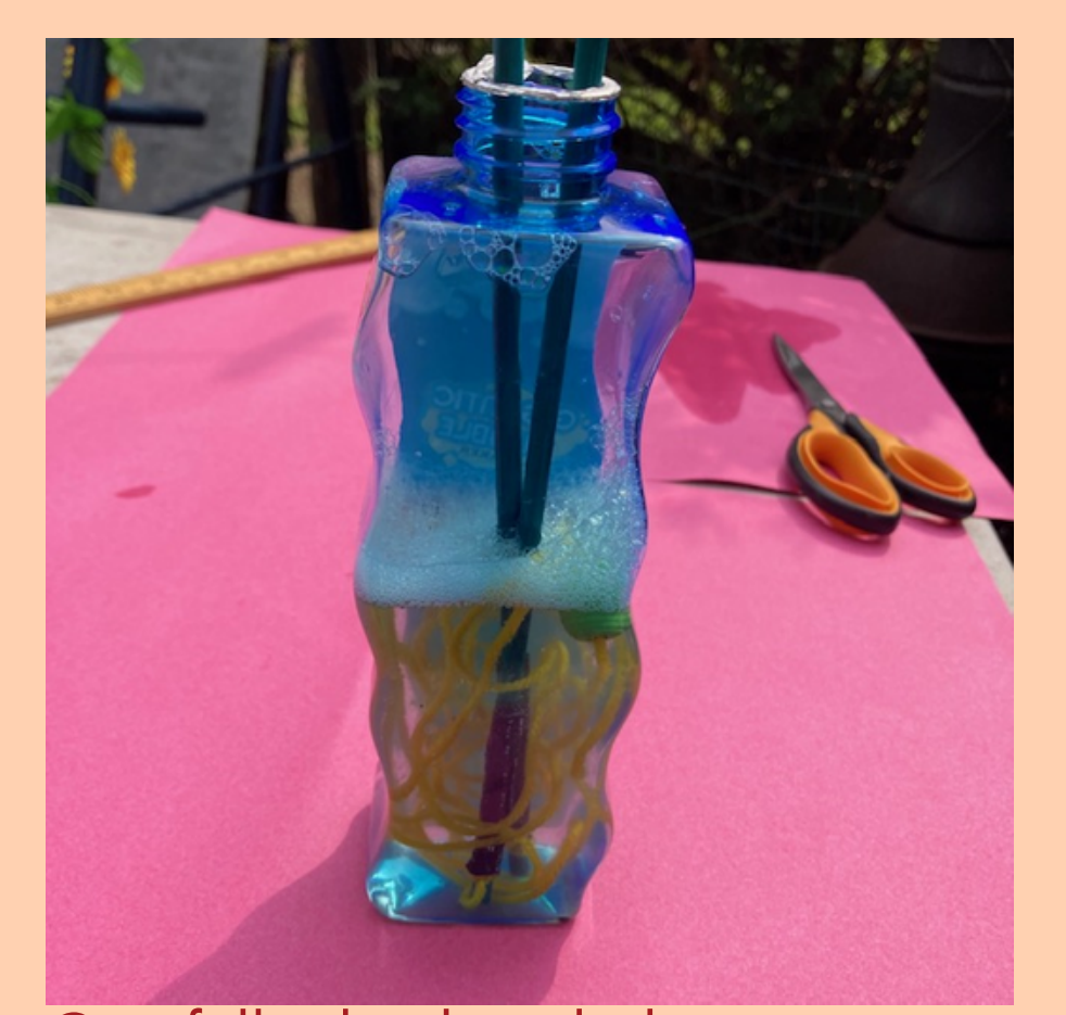
Carefully dip the whole ting into a tub of bubble solution. Make sure all the wool is in the bubble solution and it doesn't get tangled. It might help to have an adult hold the tub so it doesn't get tipped over.