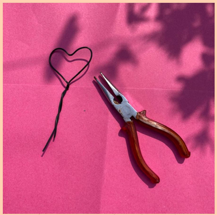
Use pliers or your hands to shape your blower. the end must meet the stick/ handle for your blower to work.