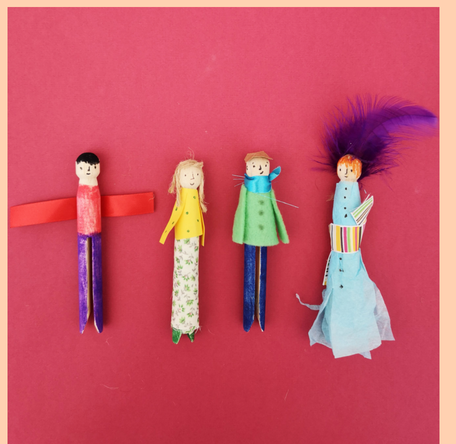
Have a go at making a collection of peg dolls using more found materials, add hats, belts and scarves. Or simply colour or paint!