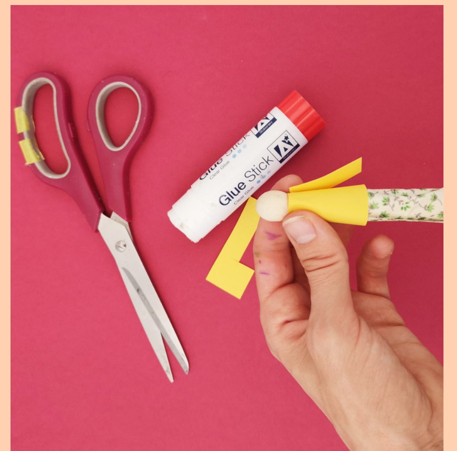
Glue the top half of the peg and stick on a small square of paper, add two strips for arms. Or again, you can add colour with felt tips