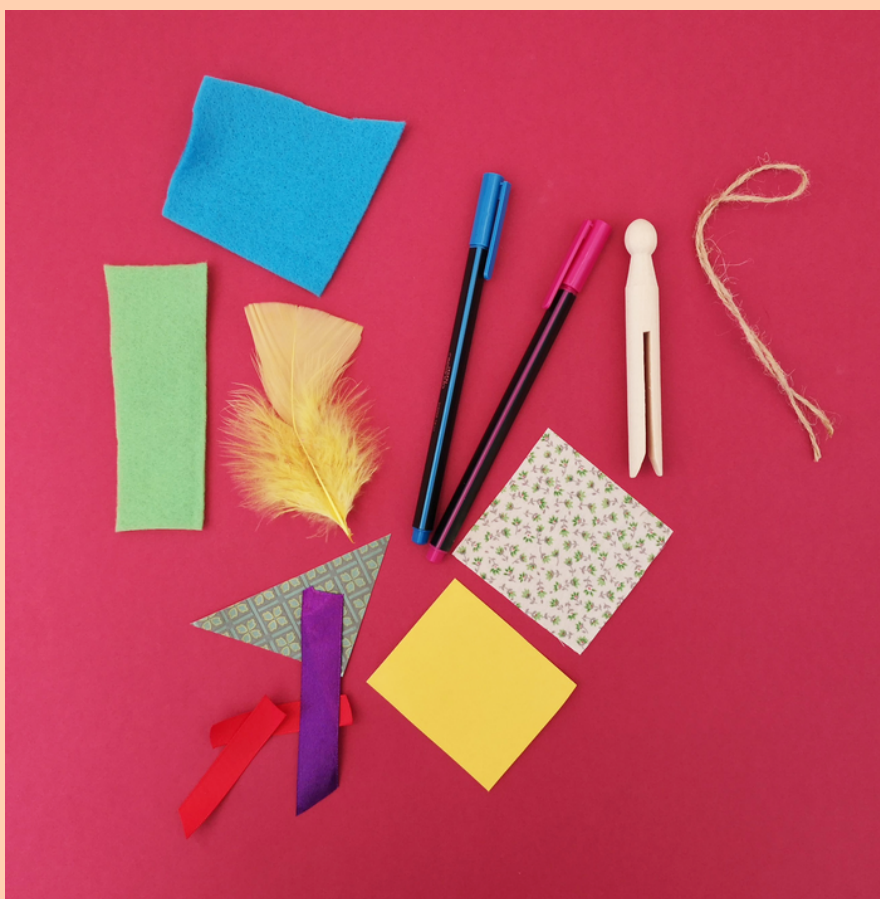
If using collage bits, decide on your outfit for your doll