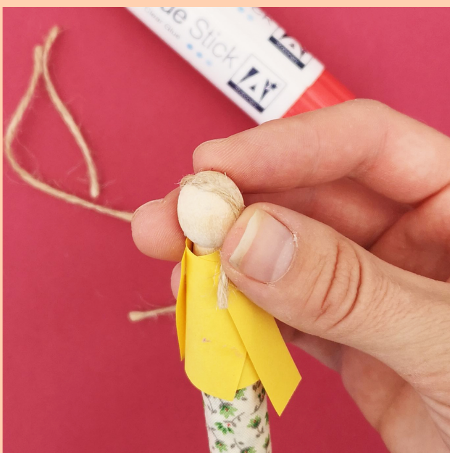
Glue the top of the peg and add in hair using some wool, string or strips of paper.