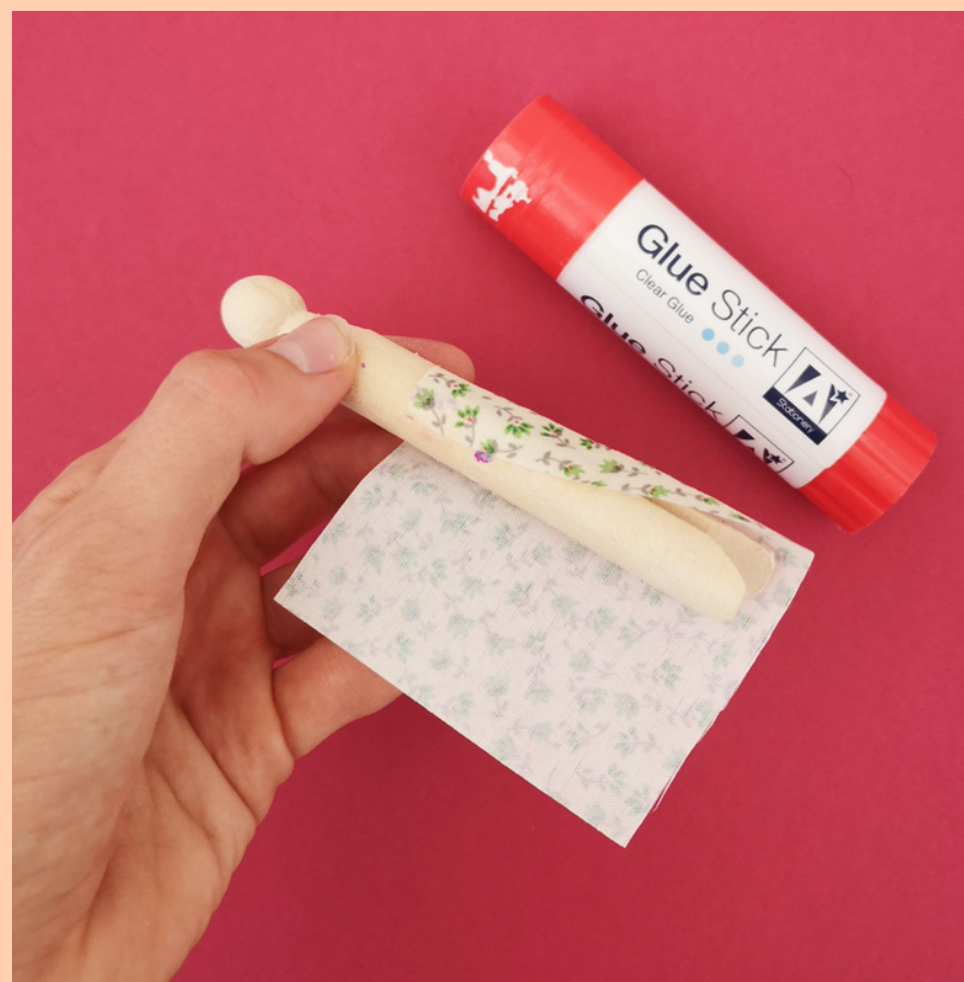
Glue the bottom half of the peg with glue and wrap around a small square of fabric (or you can colour in with one of the felt tip colours to add trousers or stick on paper).