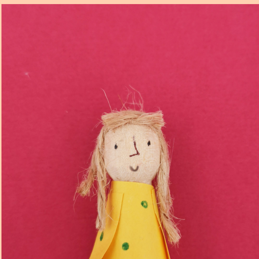
Draw in a face with a pencil or thin pen, you can add details to the clothes with pens, sequins, any collage bits you have.