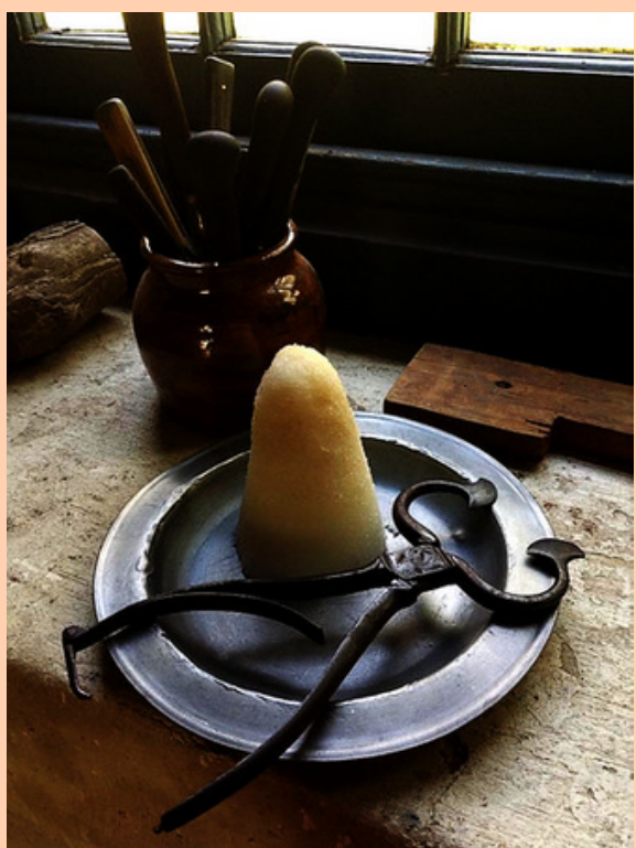
Sugar cone and nippers

However sugar came from plantations and was harvested by slaves. As people came to realise how wrong the slave trade was, an abolition movement asking people to boycott buying sugar started to take effect. About 300,000 people joined in the boycott which had a dramatic effect on the sugar trade and raised awareness greatly of the evils of the Slave Trade. This was one of the factors leading to the abolition of slavery in the British Empire in 1833.