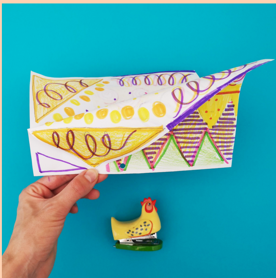
Fold the paper back in half so that the folded edge faces you and bring the top left corner of the paper down to meet the line you drew earlier. Staple in place, do the same on the other side.