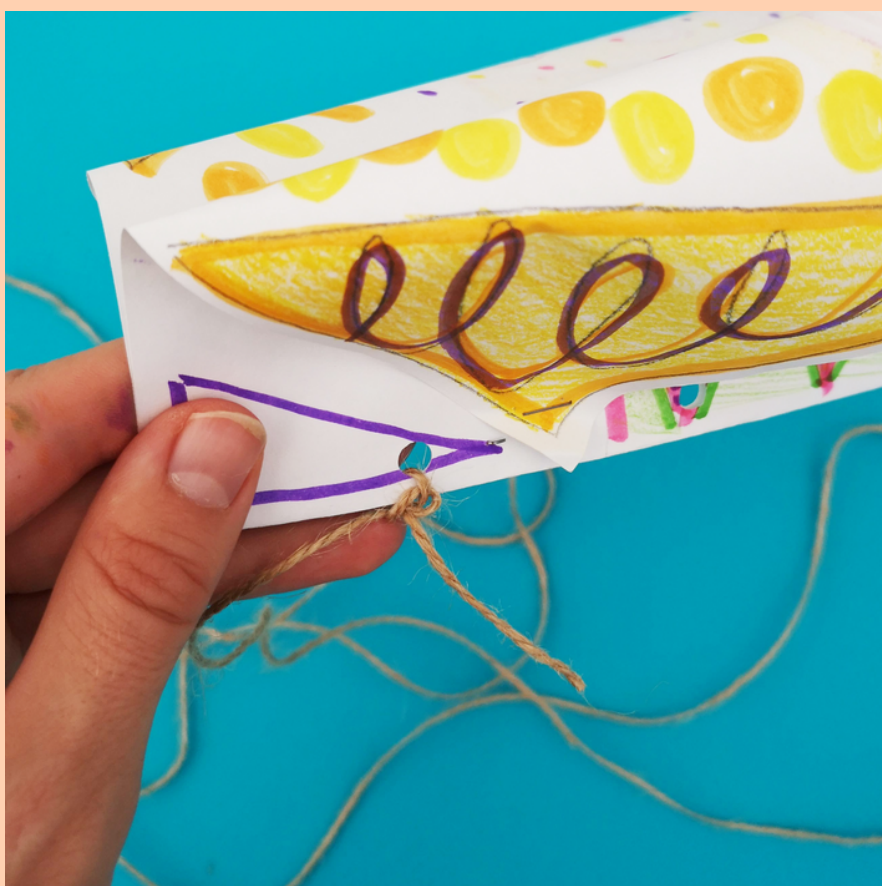
Hole punch a hole in front of the kite, cut a long piece of string and tie a knot through the hole