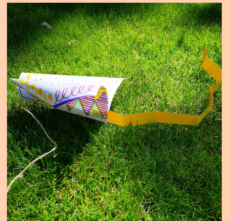
Cut the second piece of paper into strips and fold back and forth to make a kite tail. Stick or staple onto back of the kite and have a go at flying!