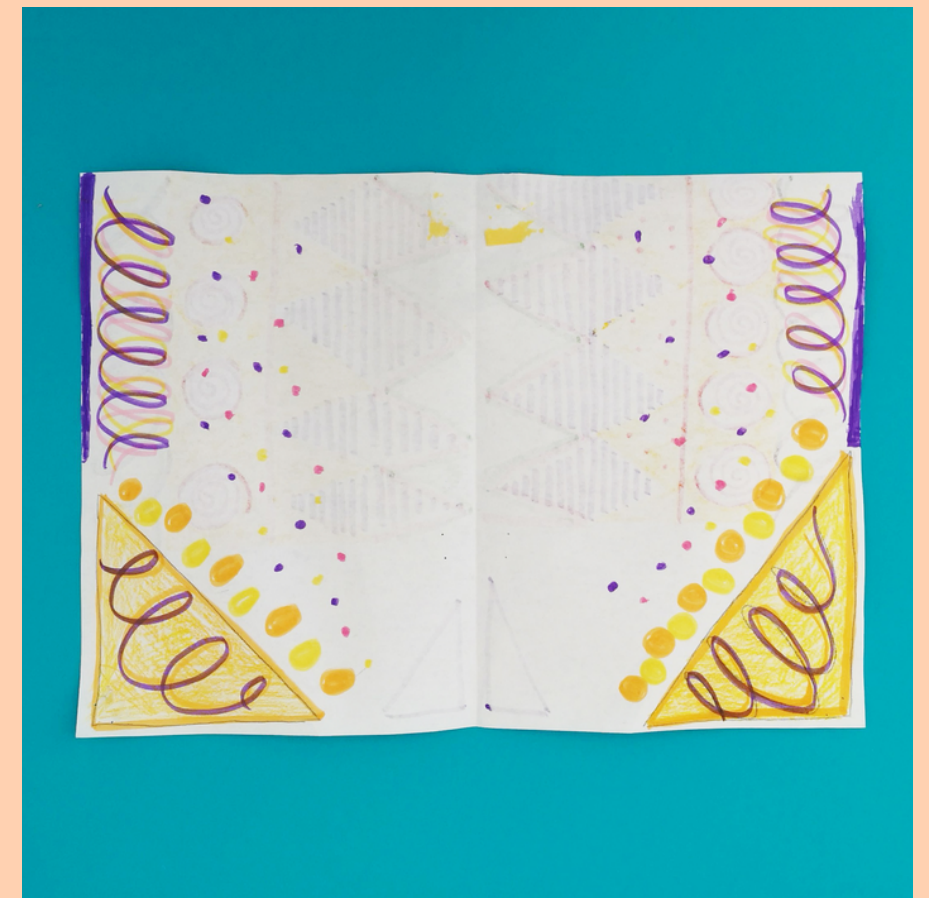
Open out the paper and on the inside add some decoration at the corners.