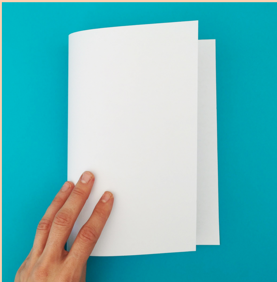
Fold your paper in half and make a neat crease along the fold.